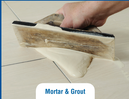
Mortar & Grout

Our focused product line is designed to solve the majority of foam issues in paint, ink and adhesive applications and utilizes only proven ingredients for defoamer and antifoam formulations. We operate three manufacturing facilities that are capable of producing small batch, bulk batch, toll manufacturing, industrial-grade and food-grade products to meet all of your defoamer and antifoam needs.