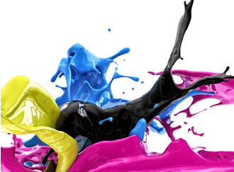
Paints, inks, coatings, and toners